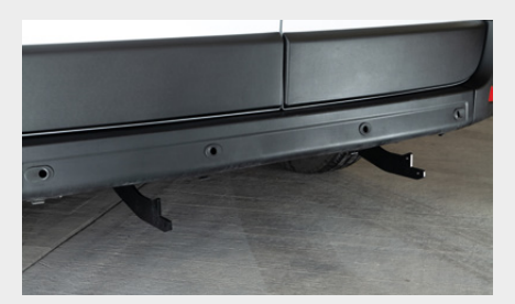
Fit the outriggers to the vehicle's under-chassis mounting points and fit the step to the other end.