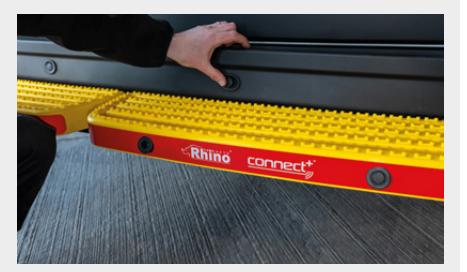
Use panel blanking plug to fill space where the sensors previously were located on the vehicle.