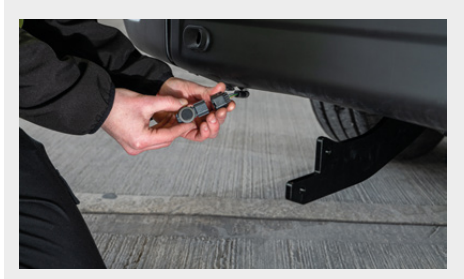
Firstly, remove the OEM sensors from the vehicle bumper and disconnect them from the wiring harness.

Fitting a Connect+ rear step could not be easier, taking around 20 minutes start to finish.