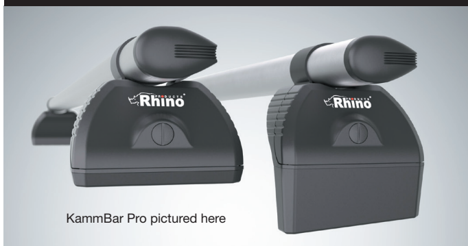
KammBar Pro pictured here

Available in two, three and four bar configurations, the KammBar Fleet comes complete with a fitting kit that includes bespoke pads and spacers, tailored to the mounting points of every vehicle.