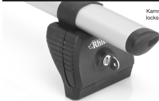
KammBar Pro with locks pictured here

Lock kits can be purchased separately to provide additional theft deterrence and security.